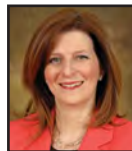
Chair / Présidente