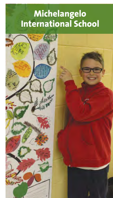
Michelangelo International School