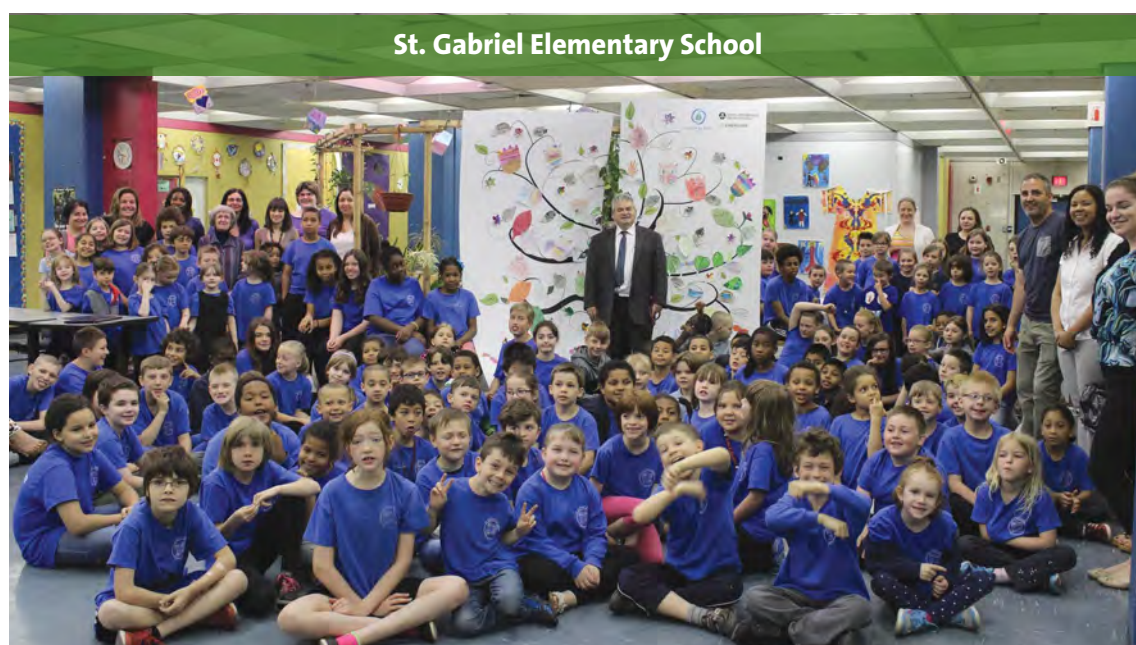
St. Gabriel Elementary School

Although all schools created award-winning trees, Dante Elementary School's "treescape" was chosen to be the overall winner, to be displayed at the EMSB head office. Judges were dazzled by the artistic finesse, attention to detail, and thought that went into growing Dante's tree. Under the