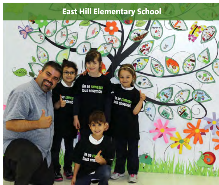
East Hill Elementary School

judges read their messages. They were very excited to share which leaves belonged to them; their passion for the environment was evident. Their tree, titled Universal, demonstrated clear messages about the community and nature