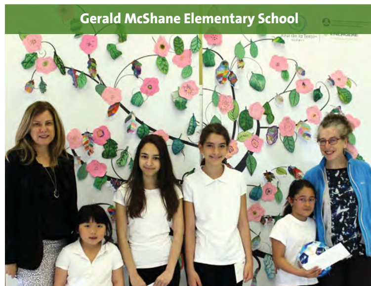
Gerald McShane Elementary School

All of St. Gabriel's 170 students participated in creating a delightful tree that pops in every way. Using a variety of colours and shapes, it was clear from their efforts and messages that they took pride in their tree. Situated in the Oasis Garden, which is in the middle of a thoroughfare of St. Gabriel School, students walked by with their classes while the