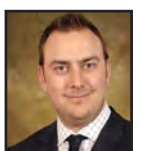
JASON TRUDEAU Elementary Schools / Écoles Primaires