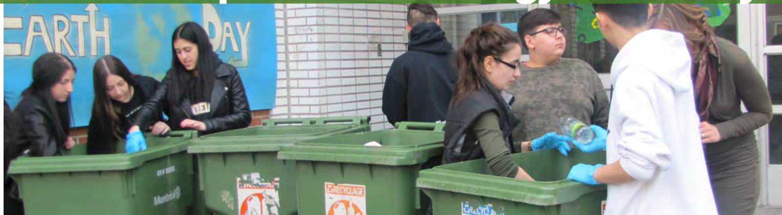
EMSB students like these are committed to recycling.

The EMSB received proposals from three firms for this project, of which Énergère's was deemed to be the best. The company