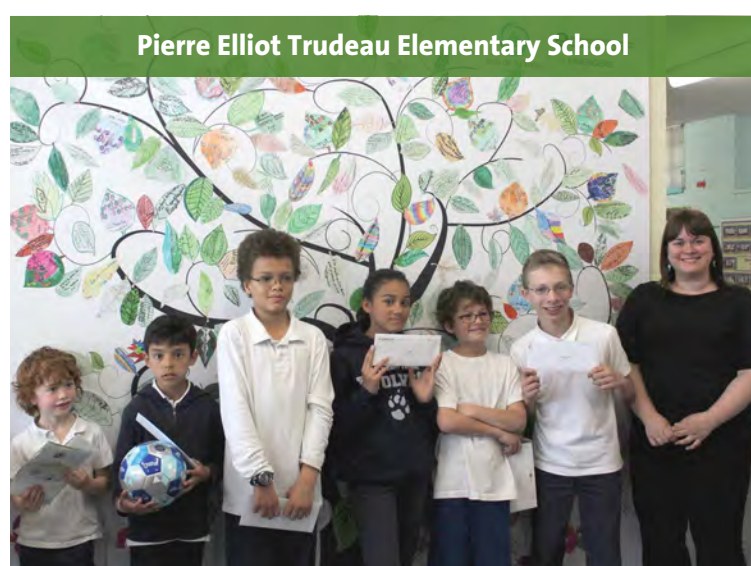
Pierre Elliott Trudeau Elementary School