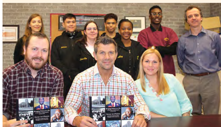
Canadiens General Manager Marc Bergevin with students and faculty during his visit to James Lyng High School.

James Lyng High School in St. Henri has launched an exciting cross curricular (history, ethics, English and French) project focusing on the history of the South West sector of Montreal. The latter encompasses St Henri, Little Burgundy, Pointe St Charles, Ville Émard. As an Urban Arts School, a focus undertaken in partnership with McGill University, the staff and students at James Lyng have posted a large scale wheatepaste mural on the exterior wall of the school featuring prominent figures from the South West. This includes jazz legend Oliver Jones, Montreal Canadiens General Manager Marc Bergevin, actor and playwright Vittorio Rossi, and many more.