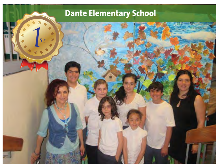
Dante Elementary School