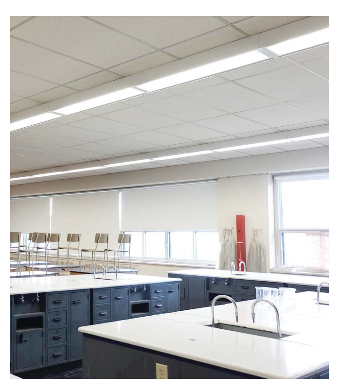
Marymount Academy International lighting before (left) and after (right) the work undertaken by Énergere.

ultraviolet (UV) radiation. In high doses, the latter can be very harmful on human health.